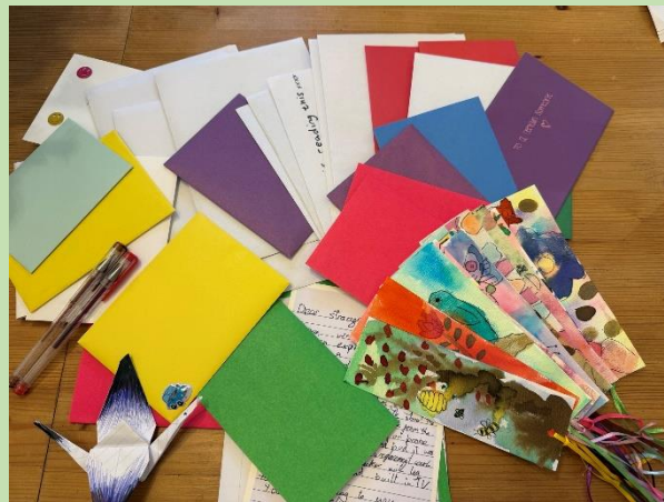
Letters sent to the charity