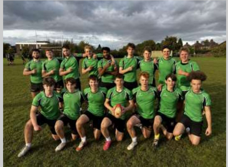
Walton's under 18 first XV team

Congratulations to our U18 First XV, who won 42-24 against a strong John Taylor High School team, in the Staffs County Cup!