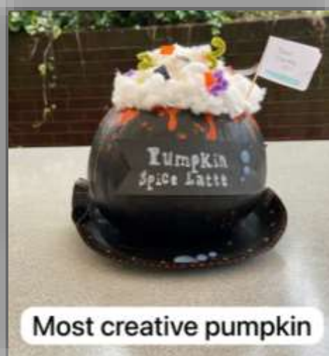
Most creative pumpkin