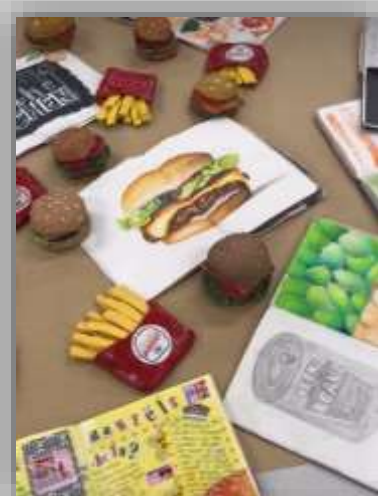
Staff, Students and events during Open Evening