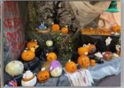
The Pumpkin Competition Display