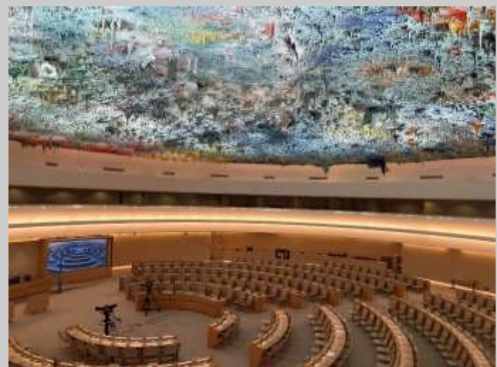
Lecture Hall at CERN