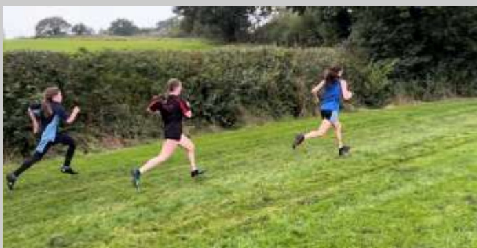
Students competing in the Cross-country event.