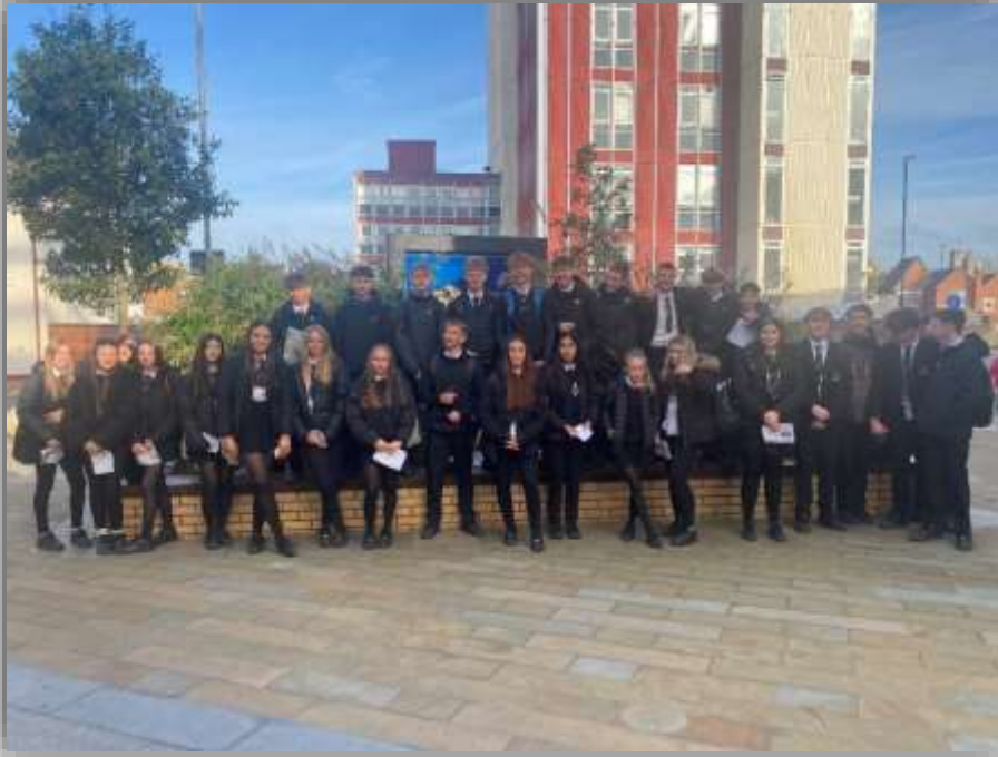
Year 11 Geography cohort

The Year 11 cohort of Geography students visited Stafford, to survey and investigate the Riverside regeneration in the town centre. This is to prepare them for their paper three exam in the summer. All students were a credit to the school.