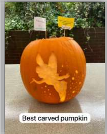
Best carved pumpkin