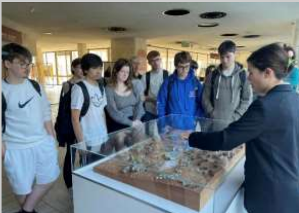
Talks at CERN

The trip also included special talks led by scientists at a conference and they even got to visit the UN. The students were fantastic and excellent ambassadors for the school. We had lots of compliments on their impeccable behaviour, excellent manners and they had some great questions for the guides.