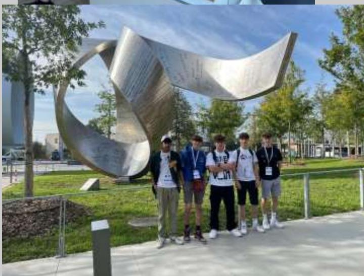
Sixth Formers at CERN