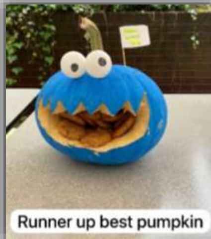
Runner up best pumpkin