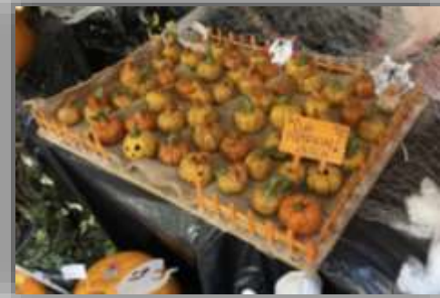
KS3 Art Club's Ceramic Pumpkins