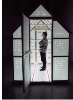
Mary Kelly, 'Words are Things', 2008