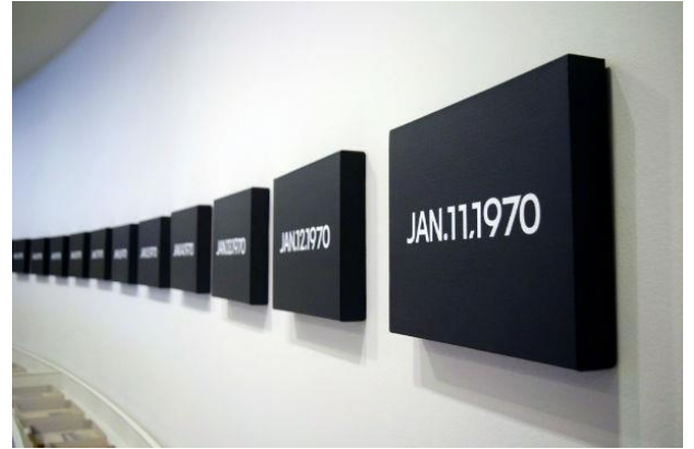
On Kawara, 'Today Paintings', ongoing

Task 1: Find a definition of Conceptual Art and write it below.